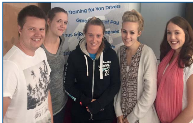
CTS' ILM course candidates

"The programme was delivered over 20 weeks with four main sessions requiring independent study, work on key