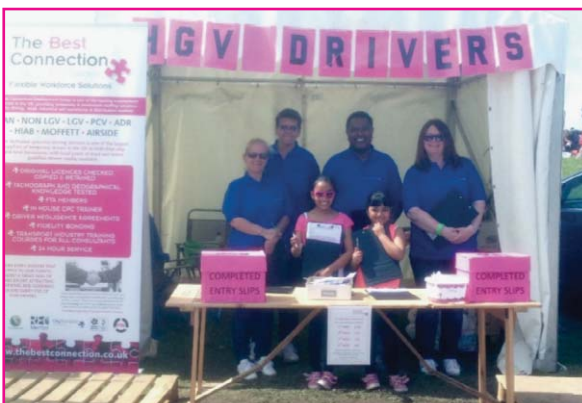
The Truckfest TBC team

elements of the Road Haulage Industry, facing fierce competition for the top places and prizes. TBC was there in force to attract interest from new drivers and we are delighted to hear that it wasn't time wasted!