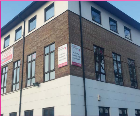
Crawley branch building